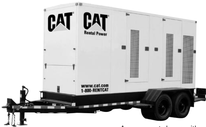
Arrangement shown with optional trailer with pintle hitch.